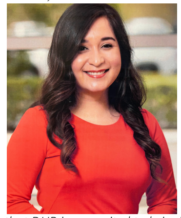
"I love that DHR is committed to bringing inovative care to the South Texas community where before patients had to seek care elsewhere."

Impact of pharmacist-led drug therapy management services on HbAlc values among patients visiting an outpatient endocrinology clinic in South Texas. Journal of Pharmacy Practice.