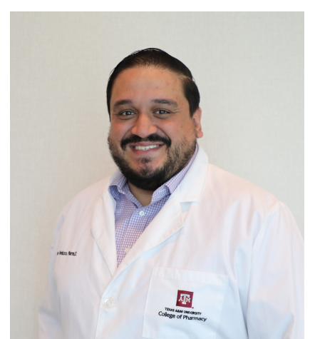
"I love working at DHR because of my great coworkers and family atmosphere ."

<u>Pharmacy School</u>: University of Texas at Austin College of Pharmacy Class of 2011