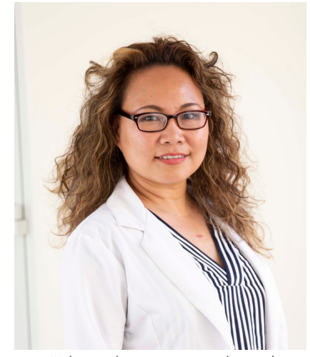
"I love the team work and collaboration here at DHR."

Certifications: Emergency Neurologic Life Support (ENLS)