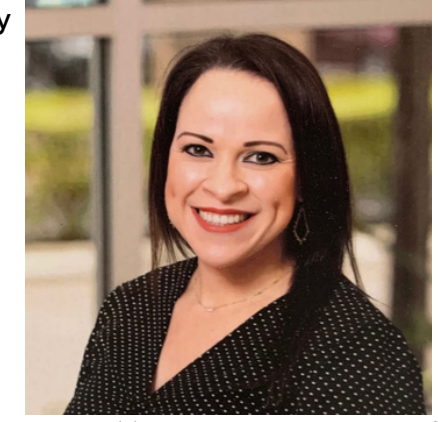
"DHR Health supports opportunities for pharmacists in different patient care areas, and the DHR Health Pharmacy family culture compares to no other."