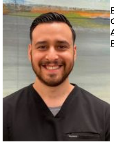
"I love the people I work with; they are like family to me."

<u>Pharmacy School</u>: University of Texas at Austin College of Pharmacy Class of 2014