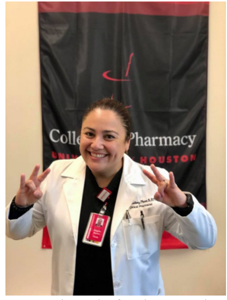
"DHR is about the family atmosphere and patient first culture."

<u>Pharmacy School</u>: University of Houston College of Pharmacy Class of 2007