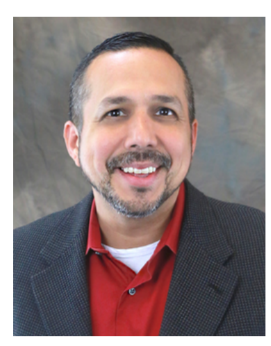
"I love the family-oriented, team-like approach to advancing our pharmacy department operationally, clinically and academically."

High dose vitamin C and thiamine as adjunct therapy for septic shock in the pediatric ICU: A case report. International Journal of Pharmacovigilance.